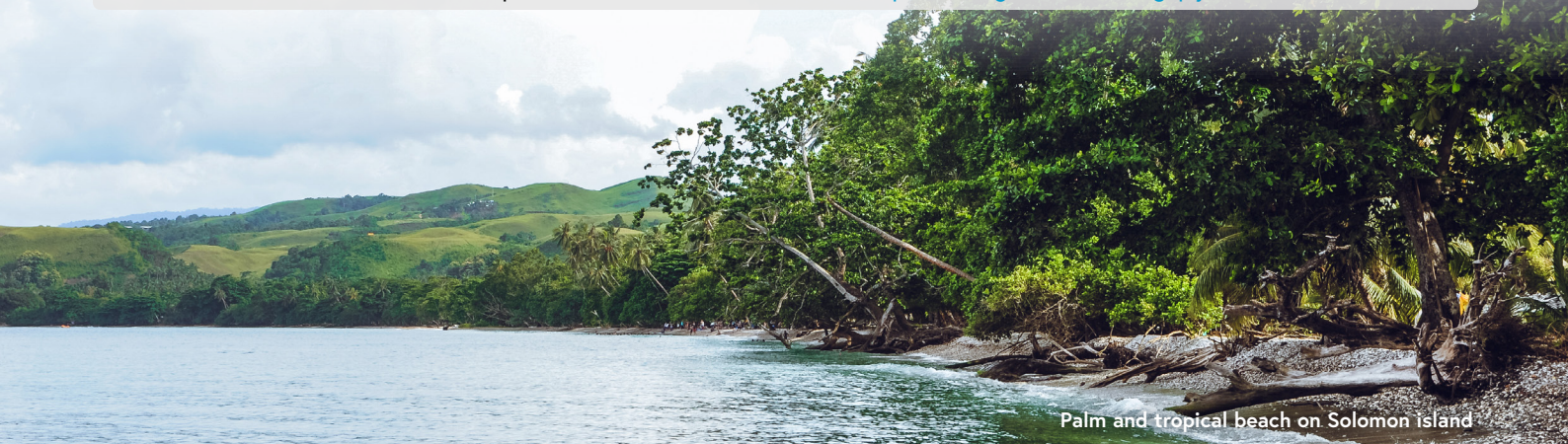
Palm and tropical beach on Solomon island

For more common phrases and translations, refer to: https://omniglot.com/writing/pijin.htm