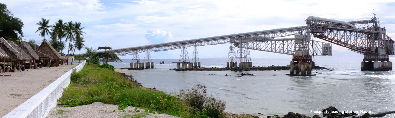
Phosphate loading station, Nauru