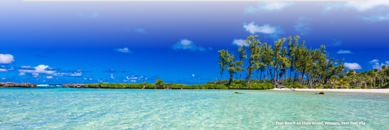
Eton Beach on Efate Island, Vanuatu, near Port Vila

For more common phrases and translations, refer to: https://omniglot.com/language/phrases/bislama.htm