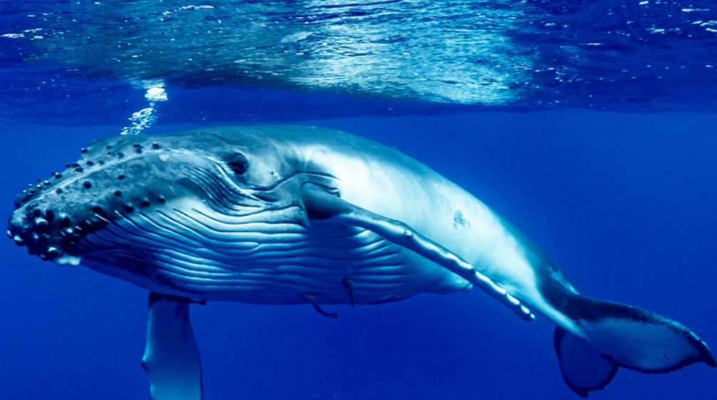
Humpback whale, Vava'u, Tonga