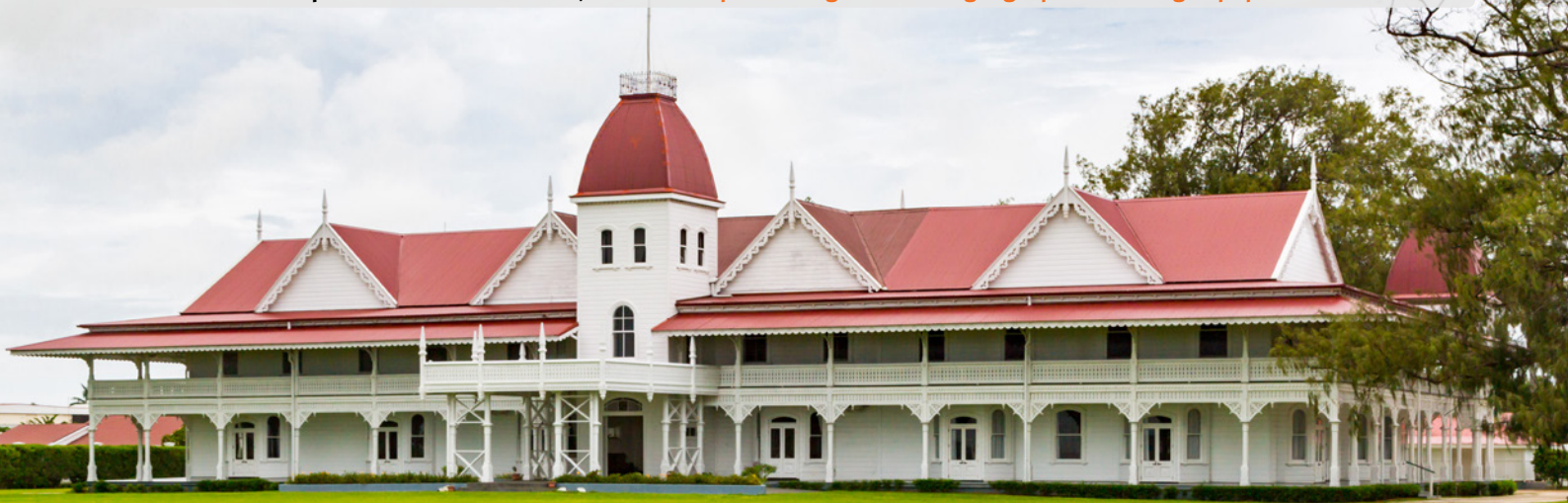
The wooden Royal Palace of the Kingdom of Tonga in the capital of Nukualofa

For more common phrases and translations, refer to: https://omniglot.com/language/phrases/tongan.php