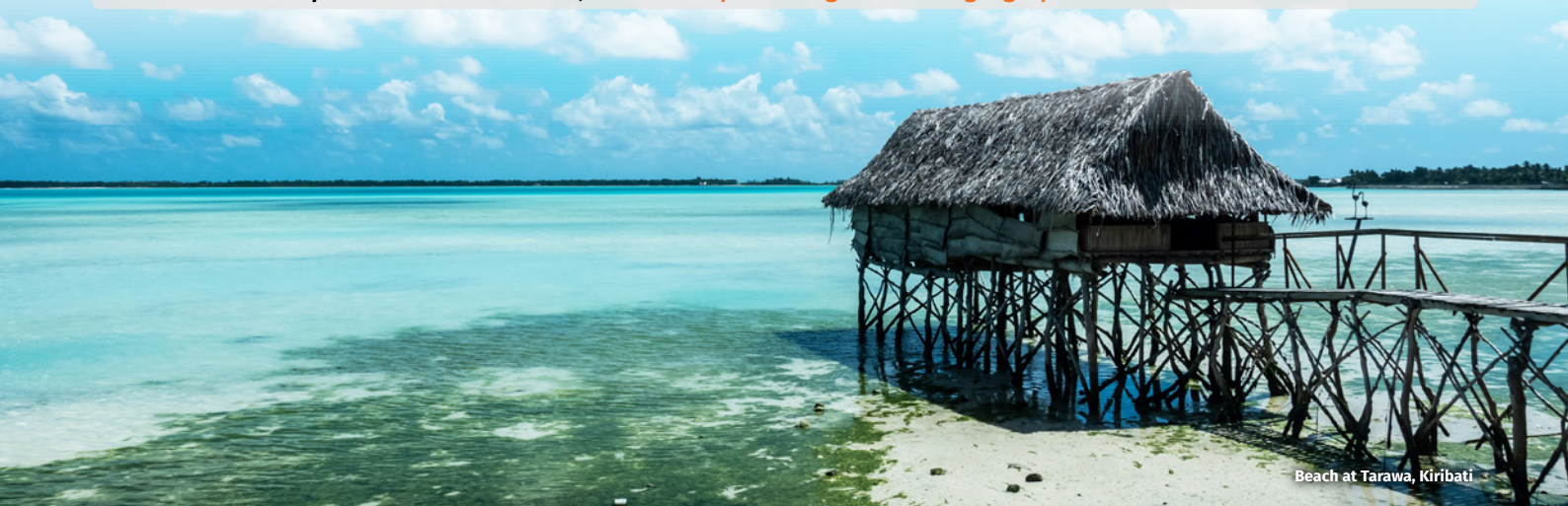
Beach at Tarawa, Kiribati

For more common phrases and translations, refer to: https://omniglot.com/language/phrases/kiribati.htm