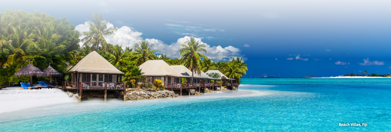
Beach Villas, Fiji

For more common phrases and translations, refer to: https://omniglot.com/language/phrases/fijian.php